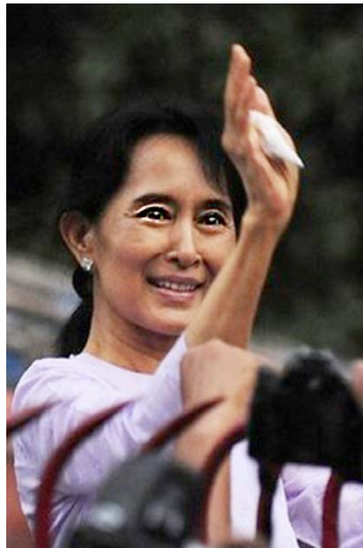
Aung Sun Suu Kyi